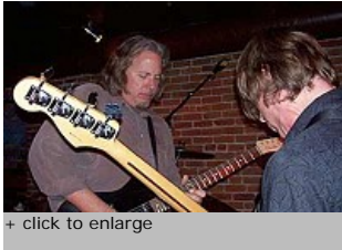
+ click to enlarge